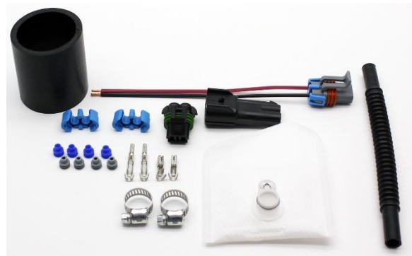
400-1174: Installation Kit