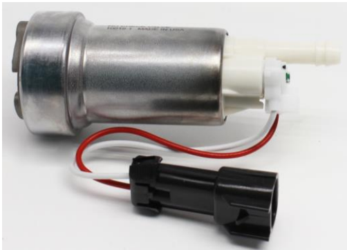
F90000295 No Check Valve: Flex Fuel Racing Pump